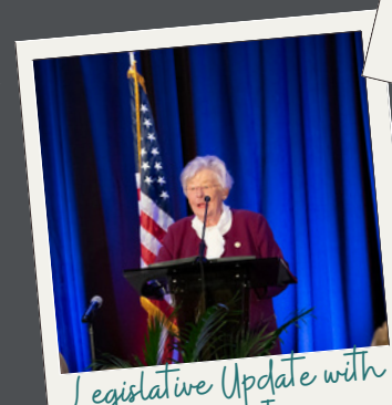
Legislative Update with Governor Ivey