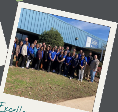
Excellence in Leadership