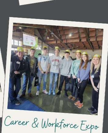
Career & Workforce Expo