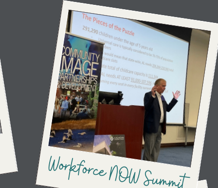
Workforce NOW Summit