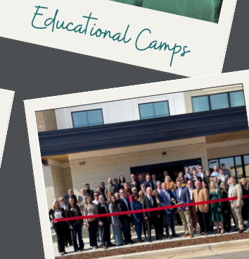
Fairfield Marriott Ribbon Cutting