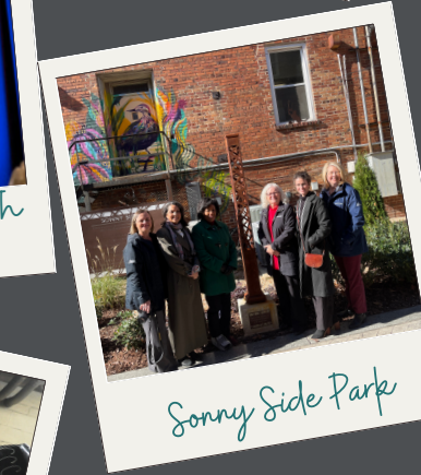
Sonny Side Park