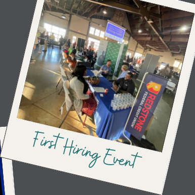
First Hiring Event