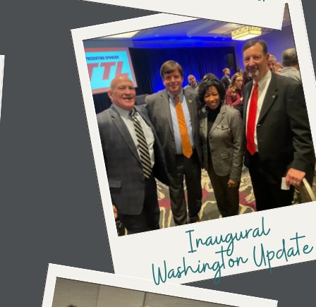
Inaugural Washington Update