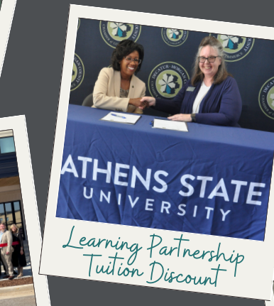
Learning Partnership Tuition Discount