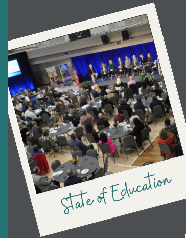
State of Education