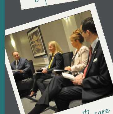
State of Healthcare