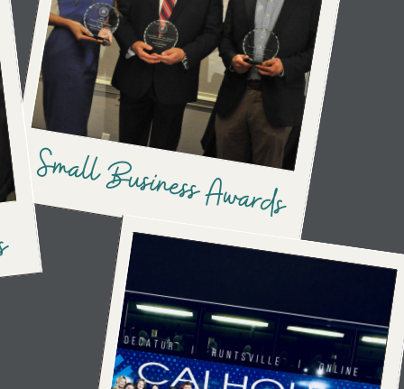
Small Business Awards